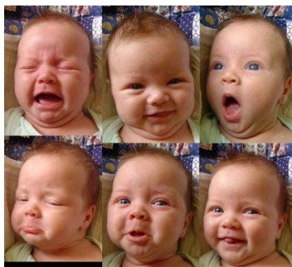
Fig. 1: Early facial expressions.