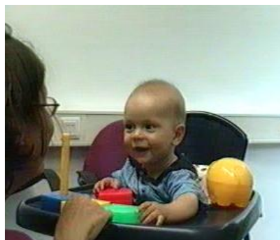
Fig. 2: Eye contact between caregiver and infant during communication.

Within the early phases eye contact/eye gaze and pointing function as cornerstones in the structuring of discourse. Infants make heavy use of eye contact both in human- and object-oriented discourse. In order to establish interpersonal communicative patterns and to signal joint attention both the children and their caretakers make intensive use of eye contact and face-to-face interaction.